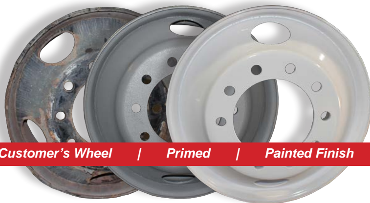
Customer's Wheel | Primed | Painted Finish

Bauer Built offers seven finish colors. Our most common finish colors are white, black and gray; other colors include orange, yellow, red and blue. We can also accommodate custom colors with a minimum order of 100 rims.